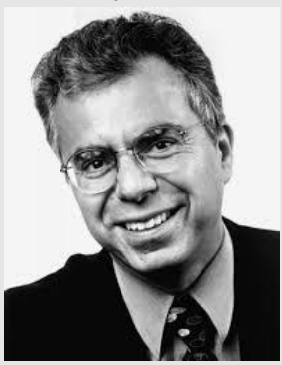
Born in 1952